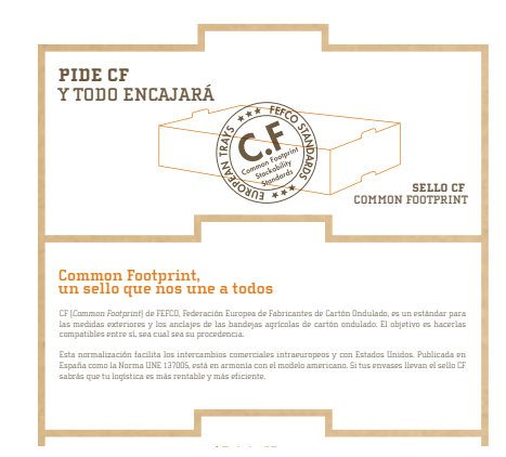
AFCO Common Footprint promotional documents

Therefore, AFCO (Spanish Association of Corrugated Cardboard Packaging and Packing Manufacturers) is promoting tirelessly the introduction of the FEFCO CF