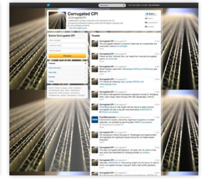
CPI Twitter page @CorrugatedCPI