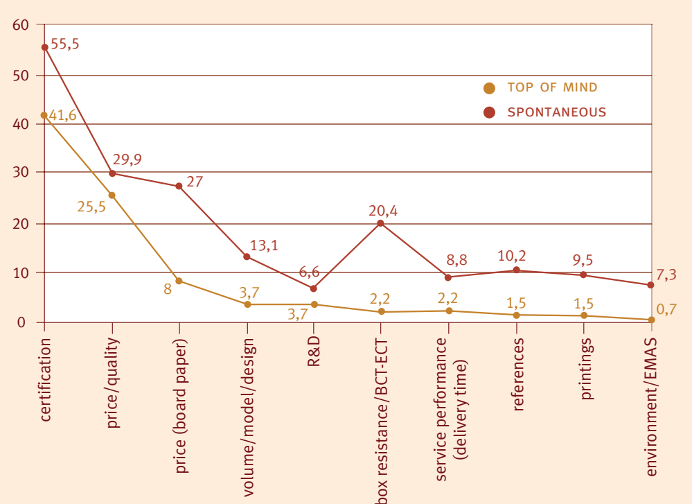
Diagram N°1 - % based on total number of respondents= 136