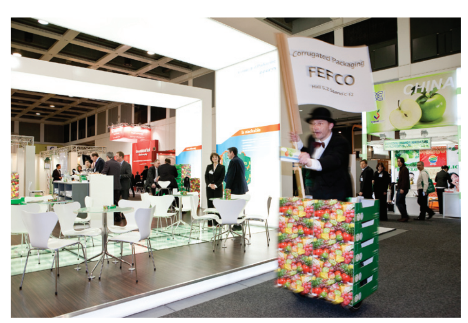
FEFCO brochures on the move

For more information about the stamp, the rights of use and the outside dimensions please visit FEFCO web site, where a CF dedicated section is available from FEFCO home page www.fefco.org, by simply clicking on the CF stamp.