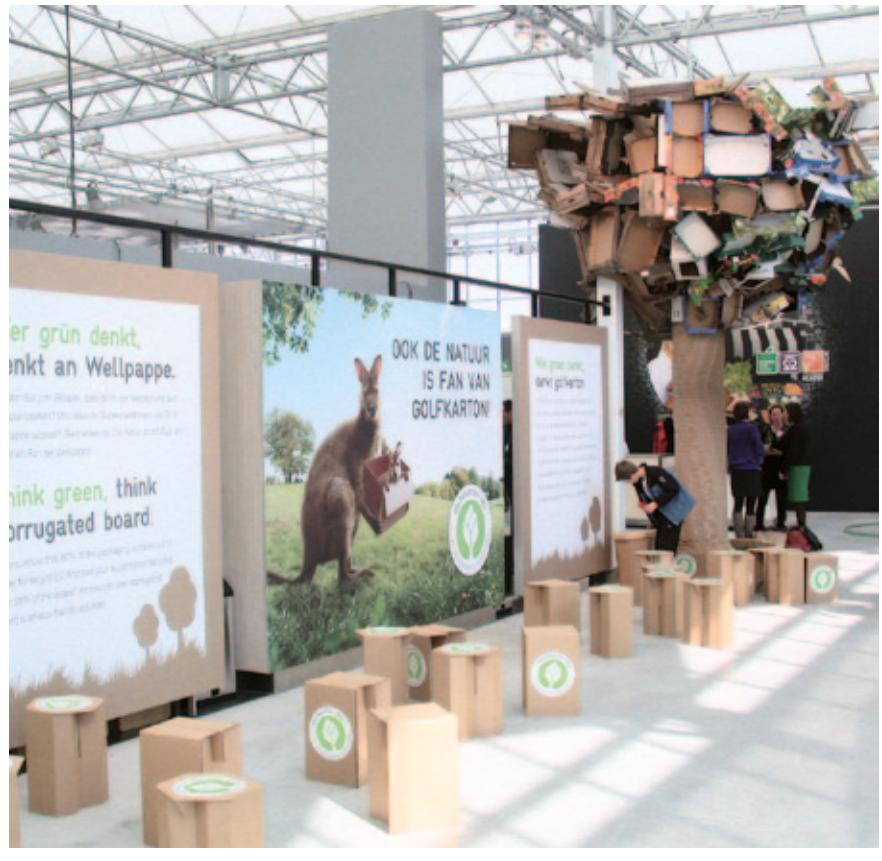
Is there anything that cannot be made from corrugated?

plants, trees, vegetables and fruit are in our daily lives. Where you can listen to beautiful music. And enjoy a relaxing moment or to dangling your feet in the water. Everywhere you go there is something new and surprising to discover. Together we will make Floriade 2012 a world of fascination. Spectacular and relaxing. Educational and fun. Active and contemplative".