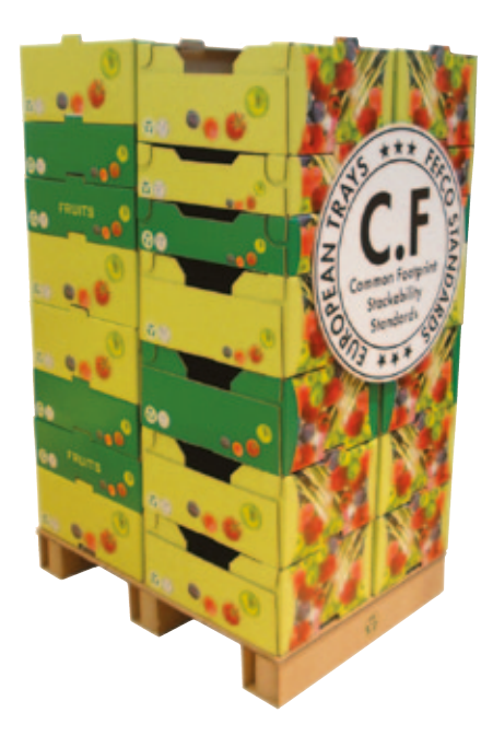
Thanks to its CF standard corrugated can compete!

This hierarchy may however be interpreted with a flexible approach.