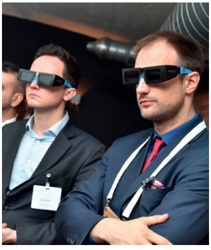
In front of the virtual store at DS Smith Brands & Experience office