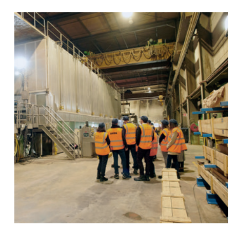
Visit of the VPK recycled paper mill