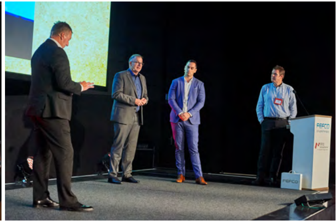
Any questions? Presenters respond to questions from the floor.