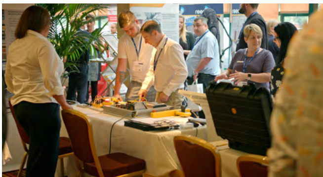
Exhibition - CPI Health, Safety and Industry Conference 2019