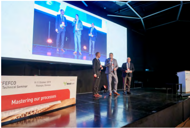
Introducing the first presenter of the conference.