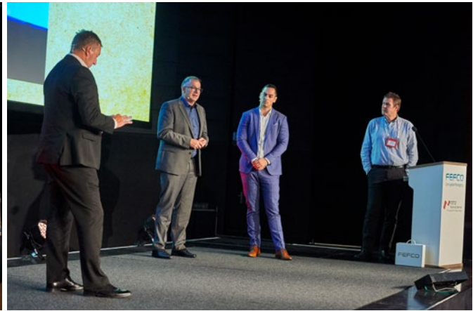
Any questions? Presenters respond to questions from the floor.