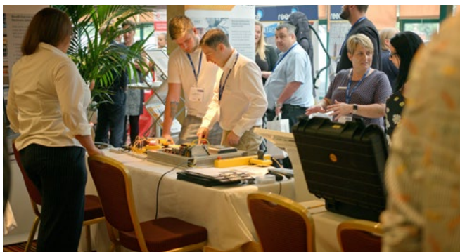
Exhibition - CPI Health, Safety and Industry Conference 2019