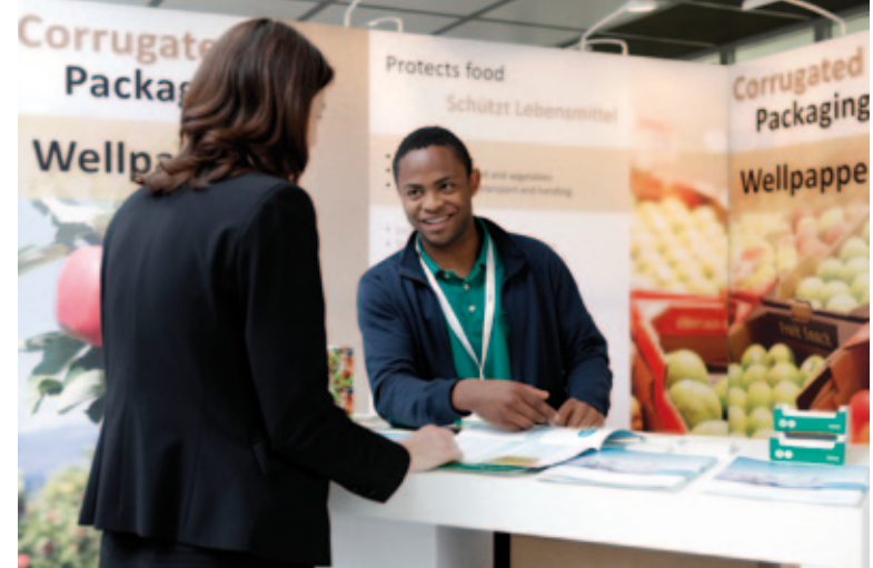
FEFCO stand in the Safe Food pavilion at Interpack

In the light of the evidence that global food wastage amounts to 1,3 bn tons – one third of that produced worldwide - and with all the indications of the enormous social, economic and ecological consequences of that wastage, we need to find a solution, and packaging is part of that solution.