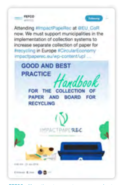
FEFCO will continue to promote messages about recycling, separate collection and all the benefits related to the Circular Economy.

FEFCO will continue to closely follow EU activities and policies that may have an impact on our members and engage on issues relevant for corrugated packaging.