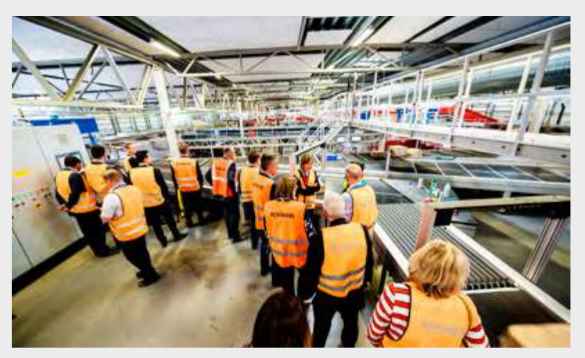
Members visiting the PostNord distribution centre were interested in the high speed sorting machine and the impact this process has on corrugated boxes. They were impressed by the forces the boxes have to withstand during sorting as well as the sorting machine's detection system.