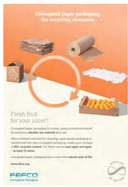
{\sf FEFC0}\ {\sf ads}\ {\sf explain}\ {\sf in}\ {\sf a}\ {\sf simple}\ {\sf and}\ {\sf visual}\ {\sf way}\ {\sf the}\ {\sf beautiful}\ {\sf circularity}\ {\sf of}\ {\sf corrugated}.

In 2018, the anti-plastic movement has shown that citizens and consumers are more and more concerned about the recyclability and sustainability of their packaging. In response to this, the EU Commission has unveiled its ambitious Plastic Strategy, the aim of which is to propose a more "circular approach" to the plastics industry. It presents a vision, sets goals in terms of sorting, reuse and recycling of plastics and proposes