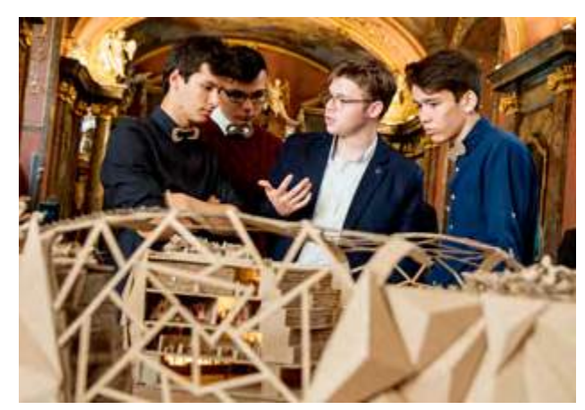
Competition entrants explain the idea behind their construction

The finalists' models will be on display at the Klementinum until 31 August 2018.