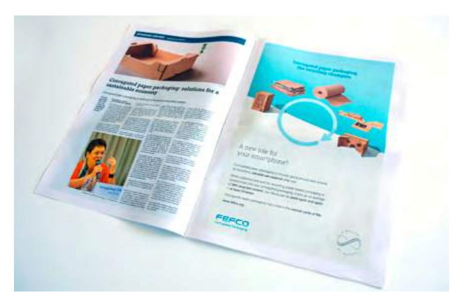
Reaching a targeted audience with FEFCO article and advertisement (Politico magazine in May 2018)

Share these with your colleagues, friends and acquaintances... in person and on social media. Like us, retweet and share - our messages know no borders!