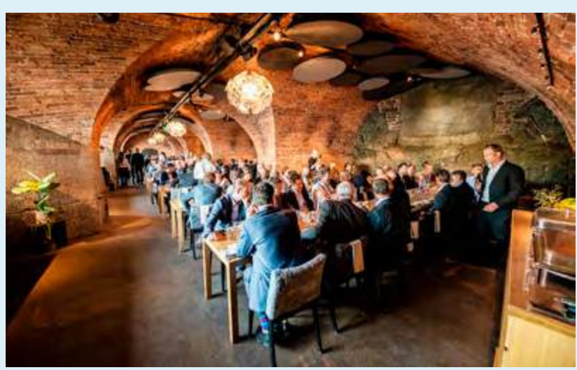
The dinner was served at the former military base Växholm Fortress.

billion shipments per year, huge efforts have been put into optimising logistic efficiency. IKEA took an essential fundamental decision when they switched from wooden pallets to corrugated pallets. Furthermore, IKEA keeps experimenting with and developing mono-material packaging solutions, to